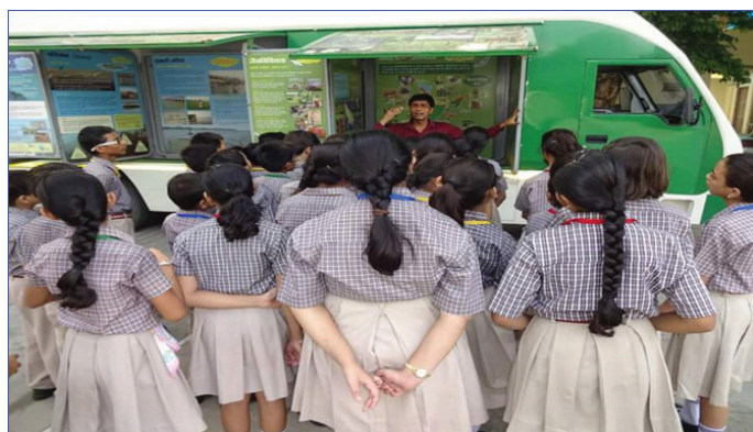
Pic 6: River biodiversity of Ganga.