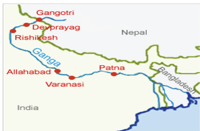
Pic 2B: Map presenting (blue line) flow of Ganga River.