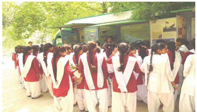
Pic 5: Prakriti Bus spreading biodiversity awareness in schools.

Ganga has its priceless ecological and economic significance and sustaining the lives of millions in Gangetic plains. As it's spiritual importance being described in Vedas, Ganga is called as MOTHER GANGA with its image of divine woman. The majority of