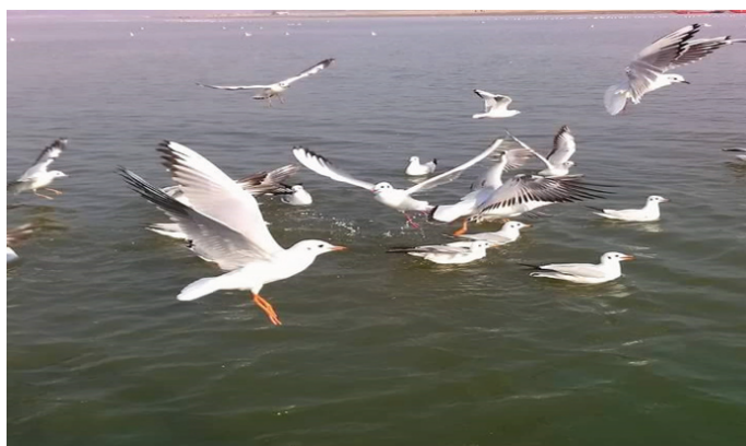
Pic 1: Migratory birds (black-spotted Gulls) inhabiting in Ganges at Varanasi.