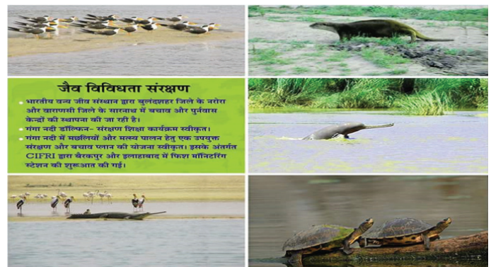
Pic 4: Rural Women at river resource management.

to Ganga are discharge of municipal sewage, human made waste disposal and untreated industrial and tannery effluents into river flow, construction of dams and barrages, overexploitation of river, unsound farming practices on riverside, deforestation, scarcity of water and reduced river flow due to diversions. In our society, women's role is important in performing the religious rituals and same in case of Ganga being one of the most sacred river of India. Women can play important role in mass awareness to create a sensitive society in rural areas as well as urban habitation. The purpose of this social research project is to encourage women's involvement in river conservation as they can play lead role to preserve ecology of the Ganga. How to turn women as river conservationist? Women are good resource manager and they are closely linked with mother nature.