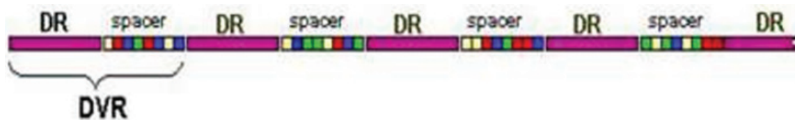
Figure 2: Direct locus [8].